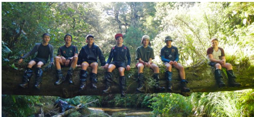
Boys of Villa House (above) and Gills House (left) getting into the spirit of Tihoi and working together as a team in the great outdoors