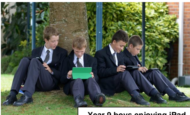
Year 9 boys enjoying iPad use as well as reading books

In addition, we continue with the use of the Values Exchange in classes and provide our most able Year 10 students with the opportunity to be involved with the IGCSE Global Perspectives programme.