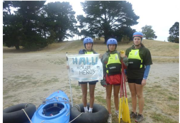
Harington Girls' of 2014 bond over team building experiences prior to the beginning of the academic year