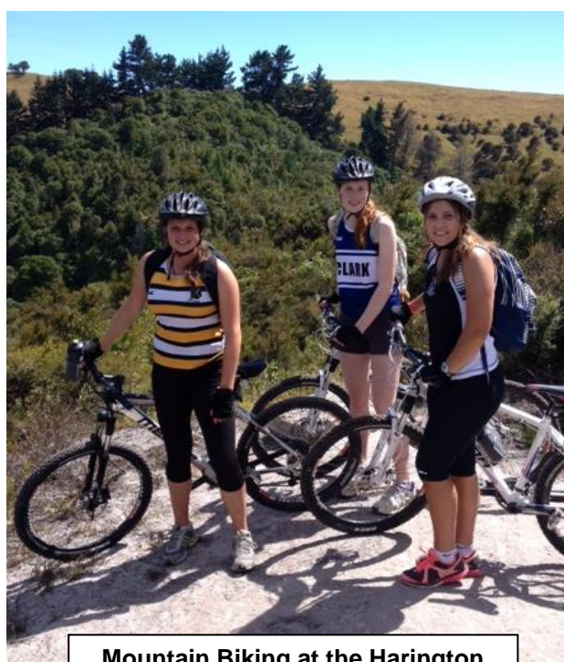
Mountain Biking at the Harington Girls' Camp

The Year 12's split into two groups for the day and spent it out at Kinloch, kayaking and tramping. The first group started with the sea kayak around the Lake, meeting the other group for lunch and then a swap over. They walked back in the afternoon, after enjoying a refreshing swim.